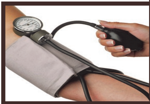
Medical Repatriation Full Body Health Checks