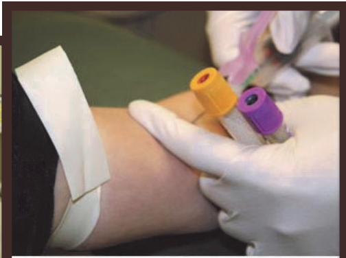
Minor Procedures Full Blood Testing and Analysis