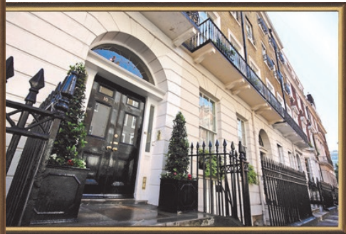
World Famous Location Luxurious Consulting Rooms